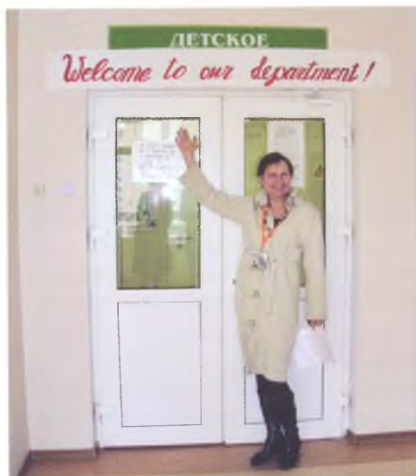
The children's ward at the Institute of Rheumatology is visited by the delegation

The Working Wonders exhibition is continuing to travel across Europe to create awareness of the issues of people with rheumatic diseases at work. Slovakia, Hungary, Croatia, Germany and the Czech Republic are some of the countries where the exhibition is going to stop in 2011. EULAR member organisations interested in hosting the exhibition in their country should contact the EULAR Secretariat for more information at birte.gluensing@eular.org ■